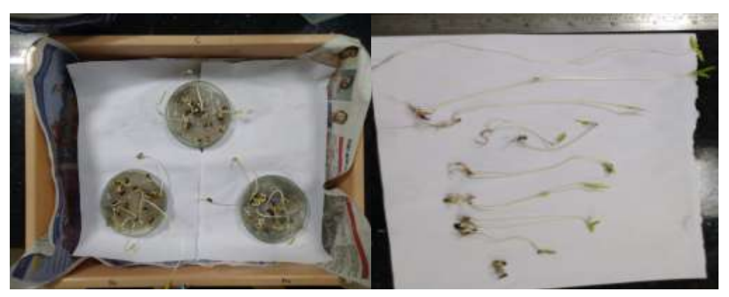
Figure 4: Plant grown after treating with insecticide.Plant grown after treating with pepsi and plant grown after treating with pesticide: