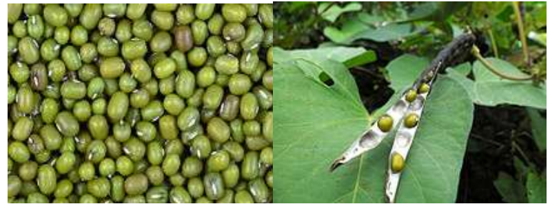
Figure 1 and 2 : Mung bean seeds and flowers.

The mung bean is a yellow-flowered annual vine with fuzzy brown pods. The English